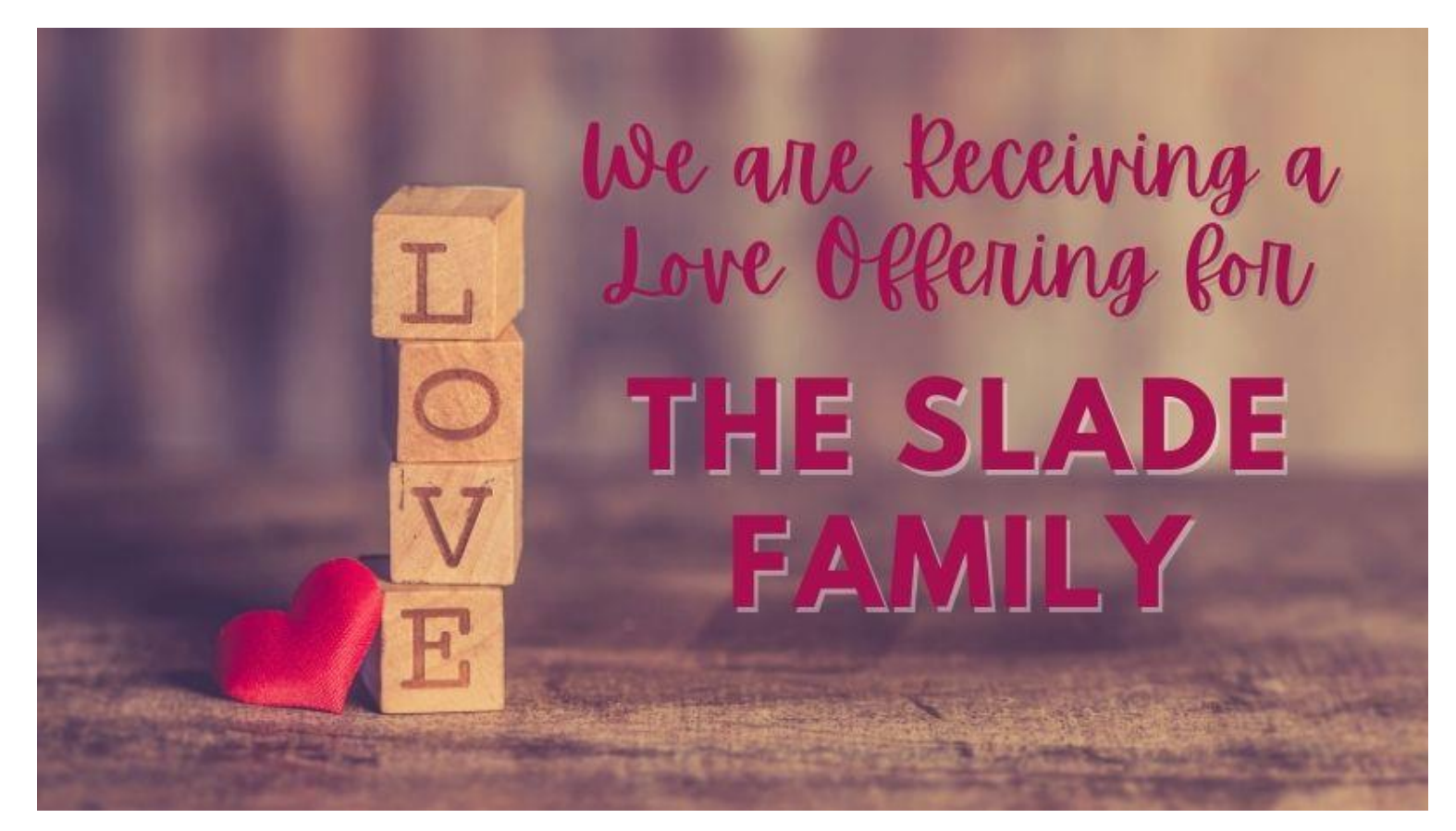
Three Ways to Give to the Slade Family:

Wednesday Night Connect Groups for all ages: Preschool, Children, Students and Adults. 6:00pm - 7:30pm Adults can search for a group <u>here.</u>