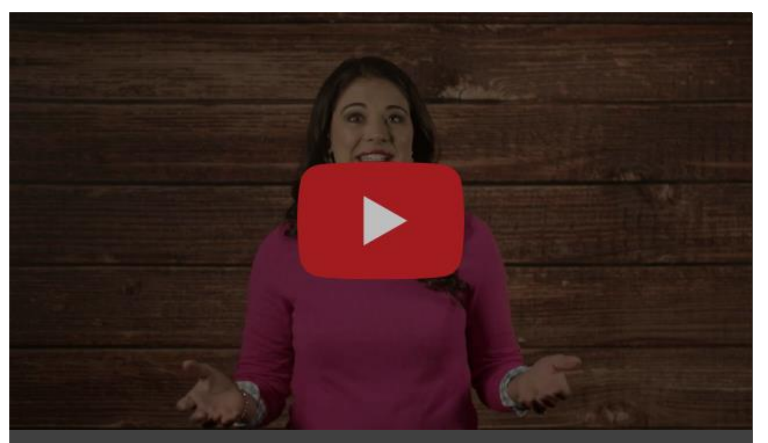
Facilities Vision Committee update video as presented on Sunday, May 1 during both morning Worship Services.

Sign up sheets are located on the board outside the game room - put your name in the space provide for your preferred role. Please sign up to help!